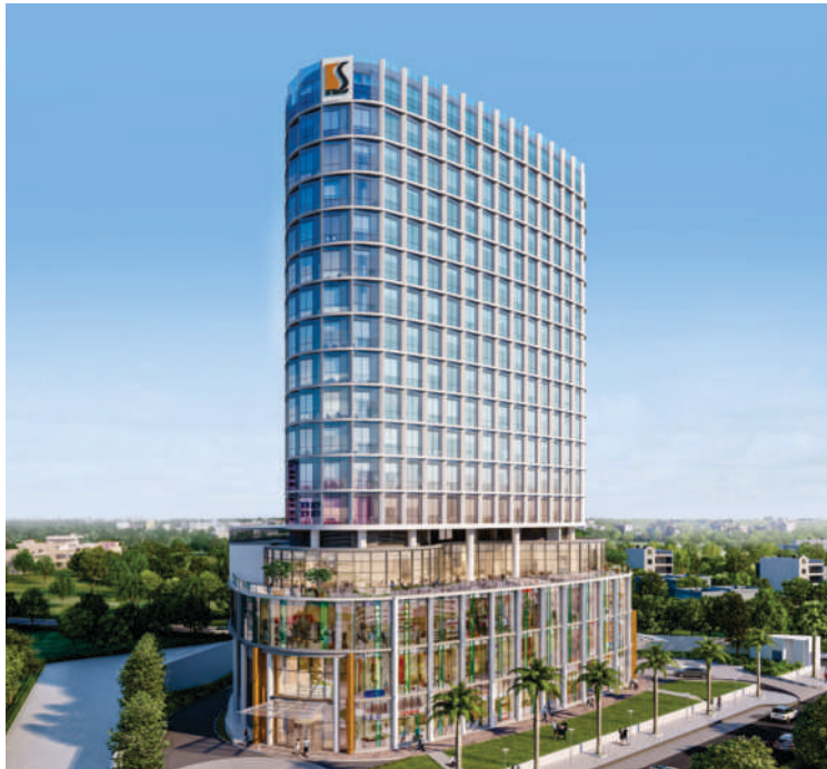
SS 100, SEC. 49, GOLF COURSE EX. ROAD, GURUGRAM