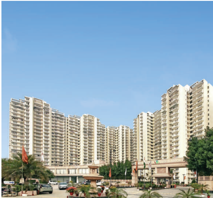
THE CORALWOOD, SECTOR-84, NEW GURUGRAM