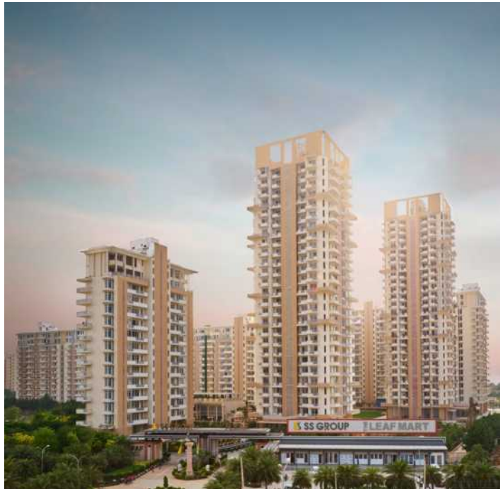
THE LEAF, SECTOR-85, NEW GURUGRAM