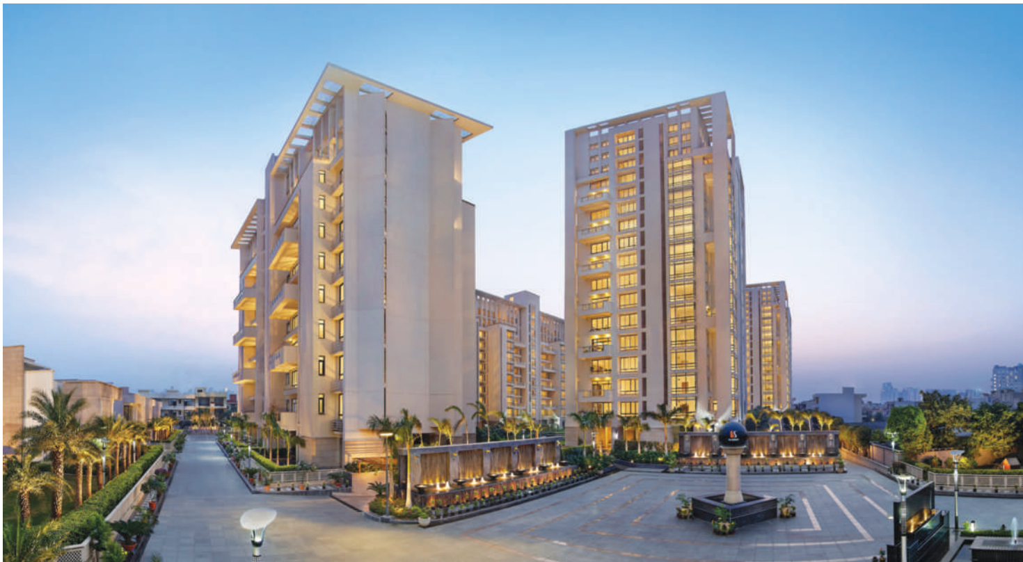
THE HIBISCUS, SECTOR-50, GURUGRAM