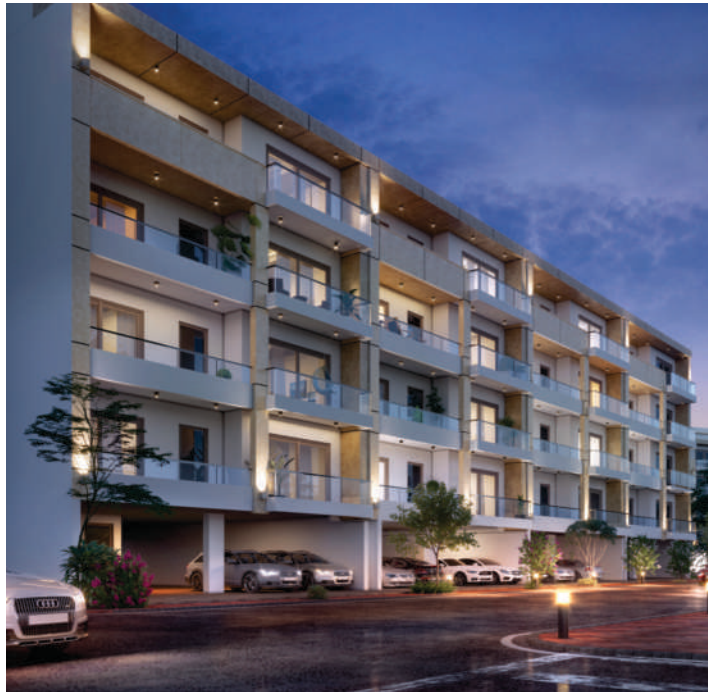
SS LINDEN, SECTOR 84,85, NEW GURUGRAM